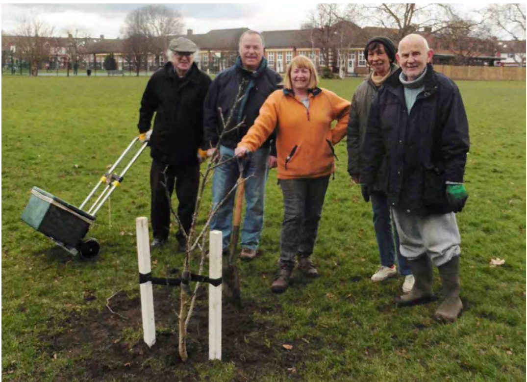
Committee members planting Walnut trees in Durnsford Recreation Ground